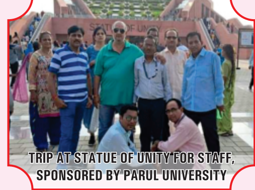
TRIP AT STATUE OF UNITY FOR STAFF, SPONSORED BY PARUL UNIVERSITY