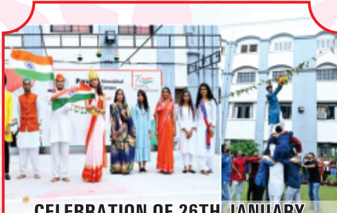
CELEBRATION OF 26TH JANUARY REPUBLIC DAY