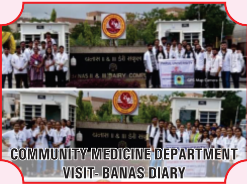
COMMUNITY MEDICINE DEPARTMENT VISIT- BANAS DIARY