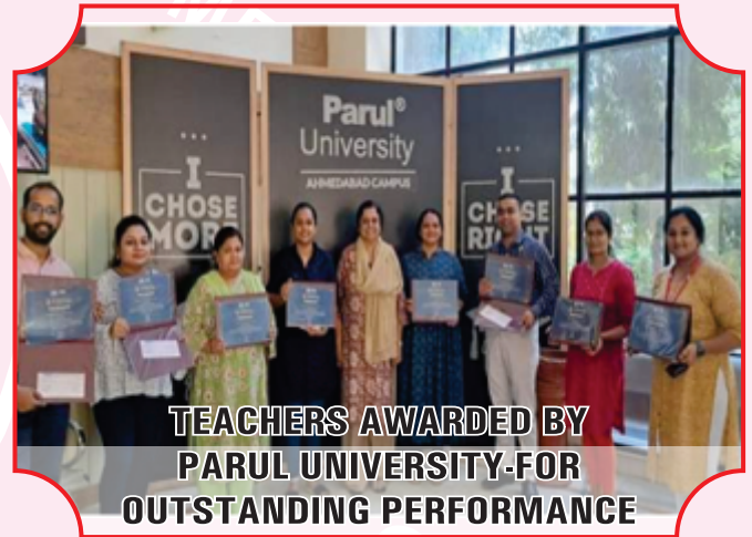
TEACHERS AWARDED BY PARUL UNIVERSITY-FOR OUTSTANDING PERFORMANCE