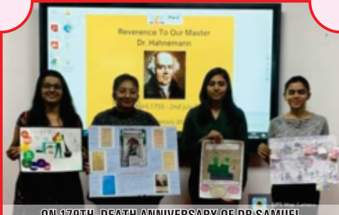
ON 179TH DEATH ANNIVERSARY OF DR SAMUEL HAHNEMANN - POSTER MAKING COMPETITION