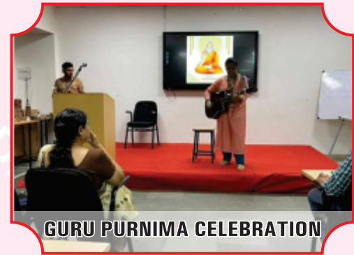
GURU PURNIMA CELEBRATION