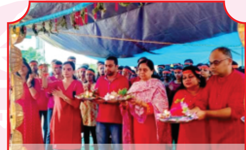
GANESH CHATURTHI CELEBRATION