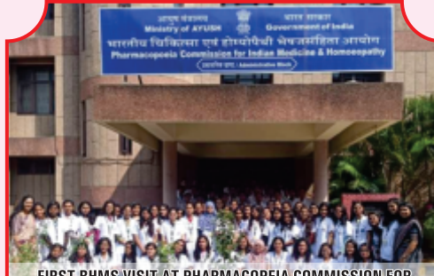
FIRST BHMS VISIT AT PHARMACOPEIA COMMISSION FOR INDIAN MEDICINE AND HOMOEOPATHY AT GHAZIABAD