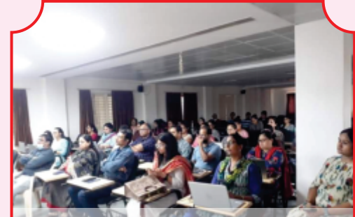
TEACHERS TRAINING PROGRAMME