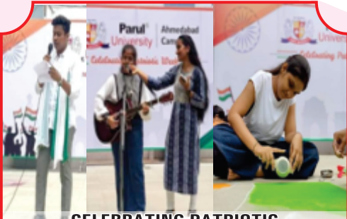
CELEBRATING PATRIOTIC WEEK-VANDE BHARAT