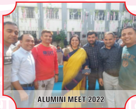
ALUMINI MEET 2022