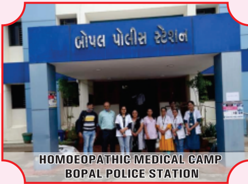
HOMOEOPATHIC MEDICAL CAMP BOPAL POLICE STATION