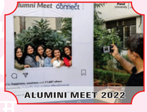
ALUMINI MEET 2022

Note : Alumini talk - Regular Alumini talk are arranged twice in a month Webinar - Renowed Homoeopaths are invited for webinars twice in a month to share their expertise