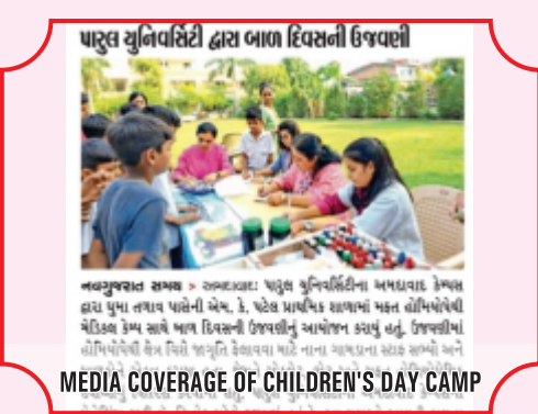
પારુલ યુનિવર્સિટી દ્વારા બાળ દિવસની ઉજવણી

નવમુજવાત સમય > સન્મહાશય: પારુલ યુનિવર્સિટીના ભવિષ્યવાદ કેમ્પ દ્વારા પુના નગર પાલિકા એમ. કે. પટેલ પ્રાથમિક શાળામાં મહત્ત્વ ધોમિયોપેથી મેડિસ કેમ્પ આરો માથ દિવસની ઉજવણીનું આયોજન કરાયું હતું. ઉજવણીમાં ધોમિયોપેથી સેન્ટર વિશે જાનુરિ કેશવવા માટે નાના આયુષ્યના સરકાર સમયે અને