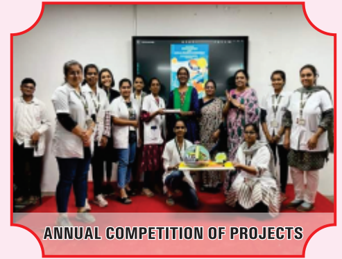
ANNUAL COMPETITION OF PROJECTS