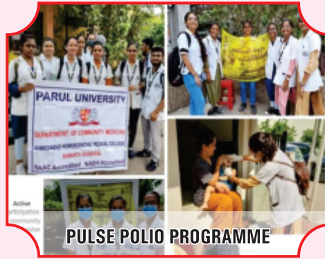
PULSE POLIO PROGRAMME