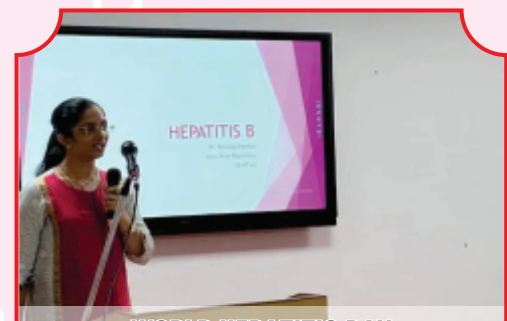
WORLD HEPATITIS DAY