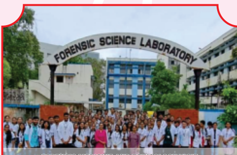
FORENSIC MEDICINE AND TOXICOLOGY VISIT AHMEDABAD FORENSIC SCIENCE AND LABORATORY